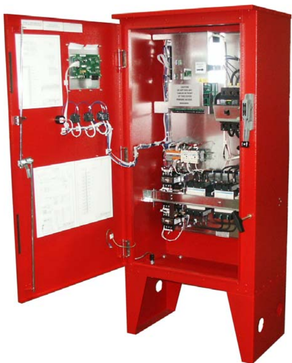
MP430 Fire Pump Controller

The controller is completely wired, assembled, and tested at the factory before shipment, and ready for immediate installation.